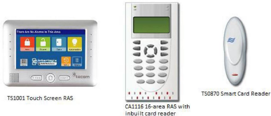
Figure 2: Typical Challenger user interface devices (RASs)

A device such as a Smart Card Reader is typically used for access control such as for opening doors. However, your Challenger system may be programmed to also use cards for alarm control, where an authorised user can disarm their assigned areas by presenting their card to a reader. The Challenger system can also be programmed to enable an authorised user to arm their assigned areas by presenting their card three times within a few seconds.