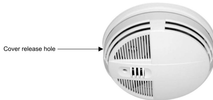
Figure 2: Location of cover release (model 449CT shown for example)

Note: Before you open the cover, ensure that you are near enough to the unit to read the sticker. Allow sufficient space for the cover to swing down to its open position.